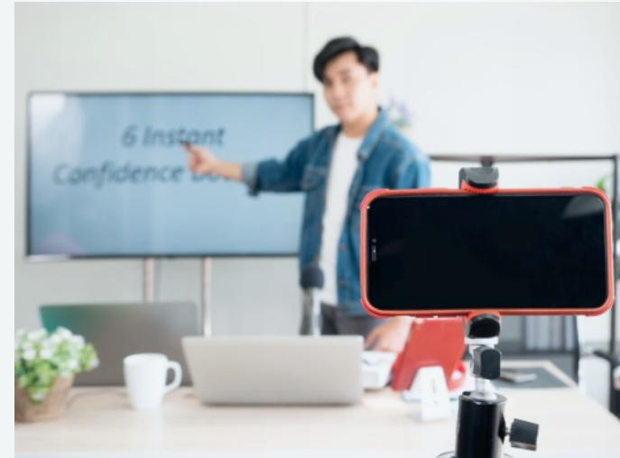
Connection Lab SIX BOX MODEL for Improved Communication

This framework is embedded in all of the Connection Lab modules. As we explore the principles and practices of effective communication, the 6-Box model offers an opportunity to see how we show up under stress, decide if that's how we want to and practices new competencies that will close the gap. Along with improved communication, participants create a shared language and culture around their communication, presentation and leadership development.